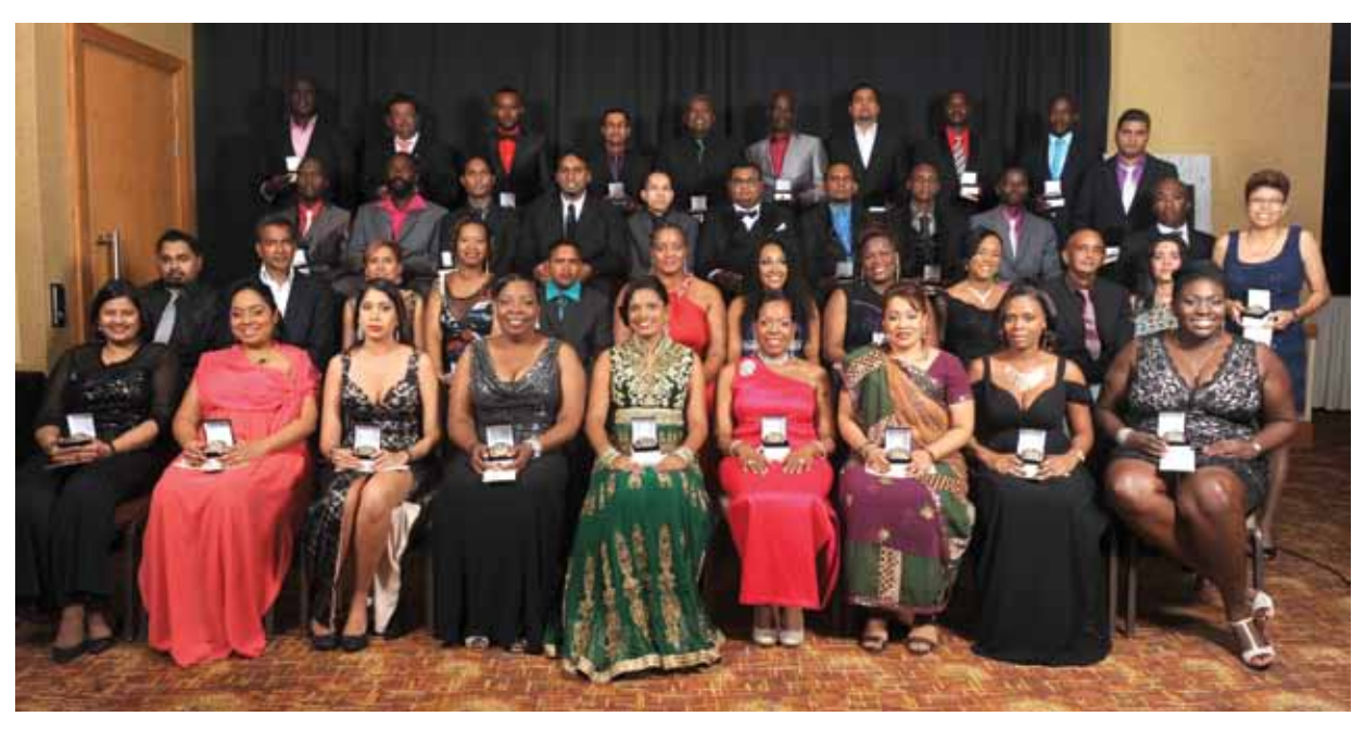
T&TEC's Best Performing Employees from each Department/Area for 2015.