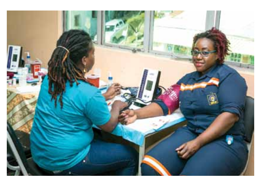
This employee seems happy to get her blood pressure tested.

As part of its outreach activities, the Committee also hosted a book collection drive in October and November. Employees were encouraged to contribute new or gently used books for pre-schoolers up to teenagers and deposit them in boxes at select T&TEC offices. All the books received, from a variety of genres like education, sports, art-creativity and fiction, were donated to registered children's homes.