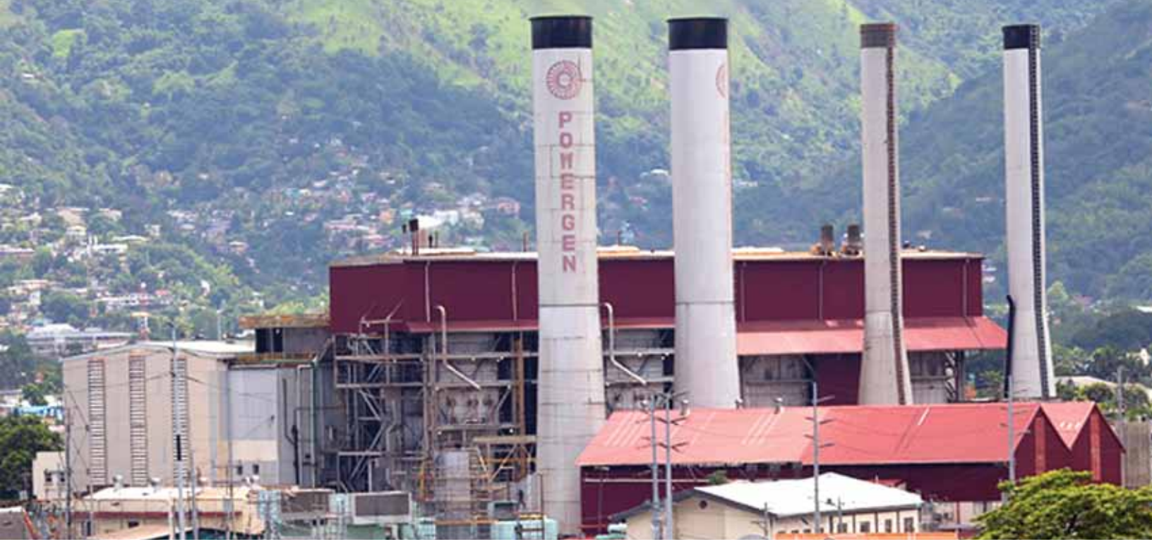
The prominent stacks of the Port of Spain 'B' Power Station, a feature of the city's skyline for generations, will be no more.

As T&TEC is responsible for the provision of gas and fuel to its Independent Power Producers, the Commission also has to negotiate with the National Gas Company for the safe removal of the gas pipeline infrastructure on the compound and with PowerGen for the disposal of two fuel storage tanks at Wrightson Road. The two storage tanks, which will either be sold or leased, housed bunker 'C' backup fuel to fire up boilers, and aviation fuel to supply the two Rolls Royce 20MW generators at PowerGen.