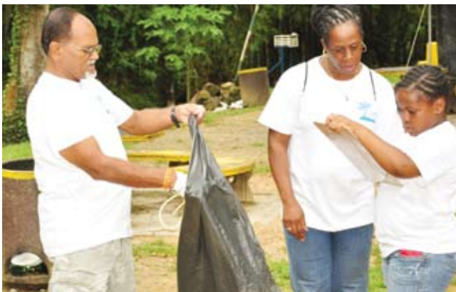
All hands, and all ages, were on deck.