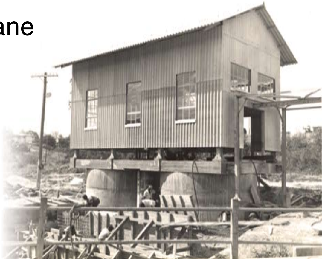
Pump House, Penal Power Plant, Penal. 9th March 1960

The Pump House, as shown in photo, was used to pump the cooling water from the Moora Dam to the Turbines.