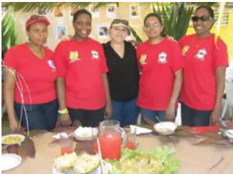
The ladies of the Northern Area Sports Club.