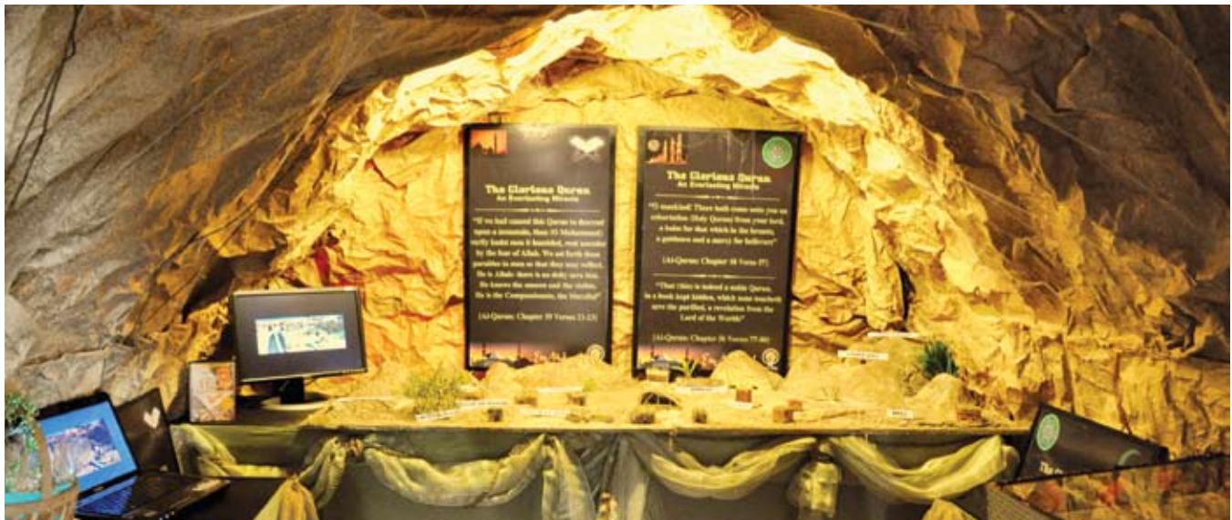
The spectacular cave display constructed by Distribution East.