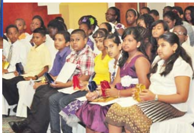
Part of T&TEC's SEA class of 2011.