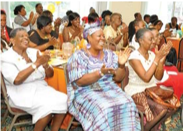
Ladies of the EAW express their enthusiasm during the programme.