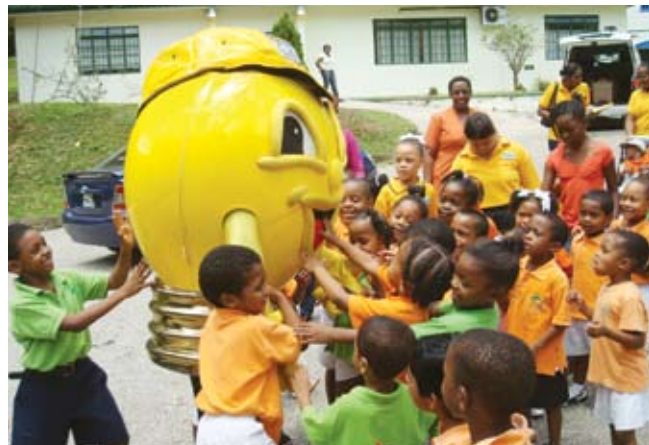
T&TEC's mascot Watty is mobbed by the happy kids.