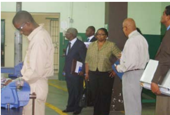
Officials from Ghana's Volta River Authority during their visit to the Port of Spain Training Facility.

Recent natural gas finds in Ghana however has meant a shift in the energy source to be used in the expansion of their electricity grid. This development has presented some challenges for Ghana with respect to the availability of skilled personnel and adequate services requiring them to rapidly build capacity.