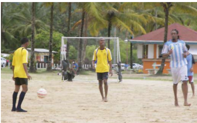
Action on the turf with beach football finalists, Penal Training Facility and PowerGen.

A local version of a Food Network "challenge" took place at Maracas Beach in July 9, when the General Sports and Cultural Club (GSCC) hosted its 9th annual Hubert Maingot 5-a-side Beach Football and Cookout competition.