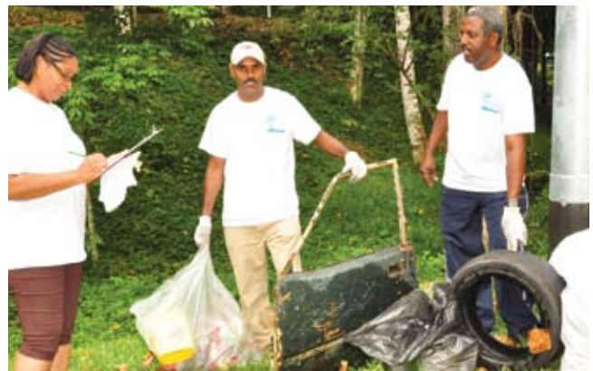
Volunteers record and sort trash for pick up.