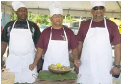
The 'chefs' of the Mt. Hope Sports Club with their winning dish.