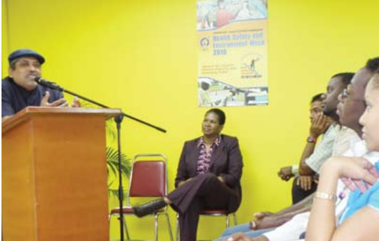
Employees of Distribution Central listen attentively to T&TEC Commissioner Chandrasain Ramsingh.