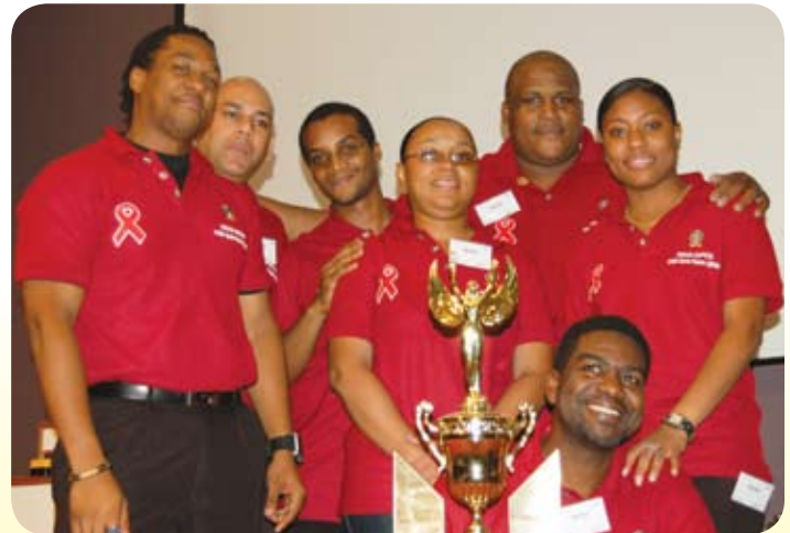
Quiz Competition 1st place – Head Office.

Congratulations to all the winners and participants! Well done. Look for other activities on the HSE Calendar.