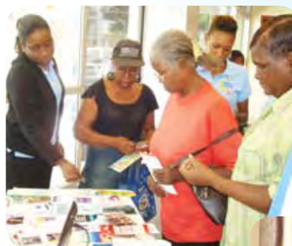
Employees and customers peruse the information literature on hand.

The lunchtime session was one of the special activities arranged by T&TEC in observance of World Aids Day.