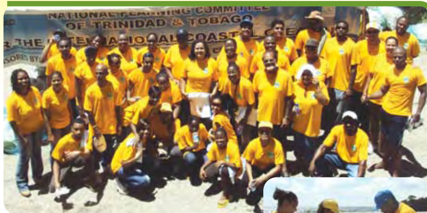
(Above) The T&TEC Coastal Cleanup 2009 contingent.

Dressed in bright orange T-shirts, the T&TEC volunteers stood out among the hundreds who turned up at Balandra and other beaches across Trinidad and Tobago for the annual event.