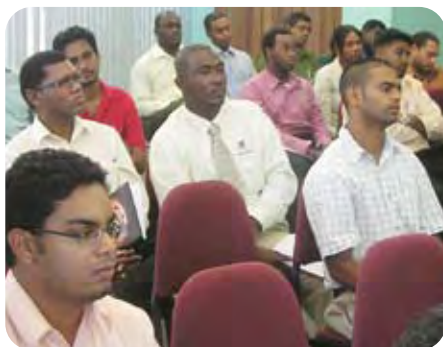
Some of the engineering enthusiasts present at the launch.

Several T&TEC Engineers presented papers at the Power and Energy Society of the Institute of Electrical and Electronics Engineers (IEEE) Trinidad and Tobago Chapter 2009 Power and Energy Seminar Series recently.