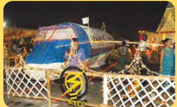
Second place winners in the Bamboo bending competition, the Supplies and Metering Departments.

T&TEC's employees, family, friends and customers enjoyed another successful year of Divali splendor!