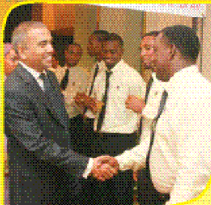
The Honourable Mustapha Abdul-Hamid, Minister of Public Utilities greets members of the Football Team.