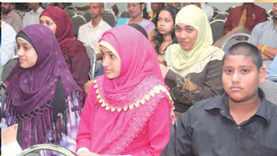
Some of the attendees at the Eid Celebrations held in Mount Hope.