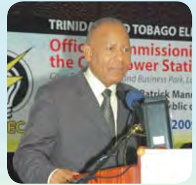
The Honourable Patrick Manning, Prime Minister of the Republic of Trinidad and Tobago delivers the feature address.