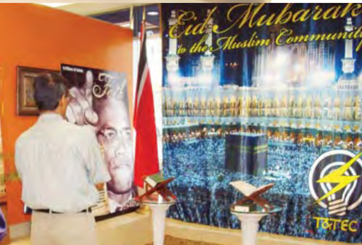
A customer takes in the Islamic décor in the Customer Service Centre, Head Office.