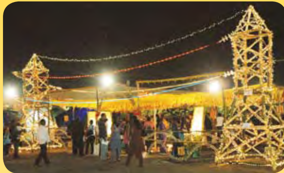
A creative display of bamboo bending by the Transmission Division, third place winner in the Bamboo Bending Competition.