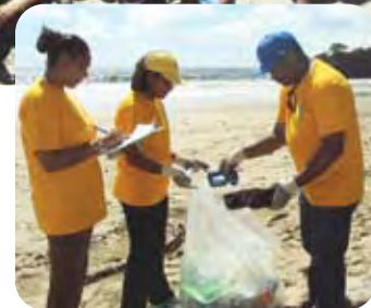
(At right) Employees at work collecting garbage from the Balandra Beach.

Together, our volunteers collected large amounts of garbage and debris including plastic and styrofoam items, glass bottles, fishing nets, clothing and tin containers. The Balandra Beach clean-up effort was clearly a success!