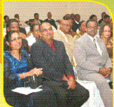
A cross-section of 30 years service award recipients with their guests.