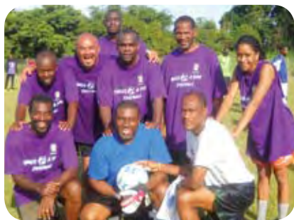
The over-40 team "Veterans International" strikes a pose after one of their matches.

It was indeed a weekend to remember when the General Sports and Cultural Club hosted its annual 7-a-side football tournament in Tobago. Originally scheduled for mid July, the H1N1 or Swine Flu scare prompted its postponement to Saturday, October 24th.