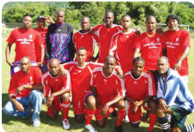
The winning team – Distribution North

All in all, a great time was had by those who attended. Next year promises to be even better!