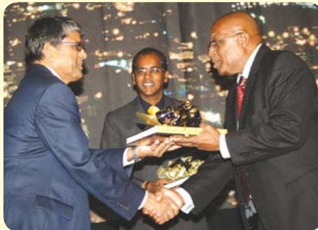
Relations Officer T&TEC and now Management Consultant.