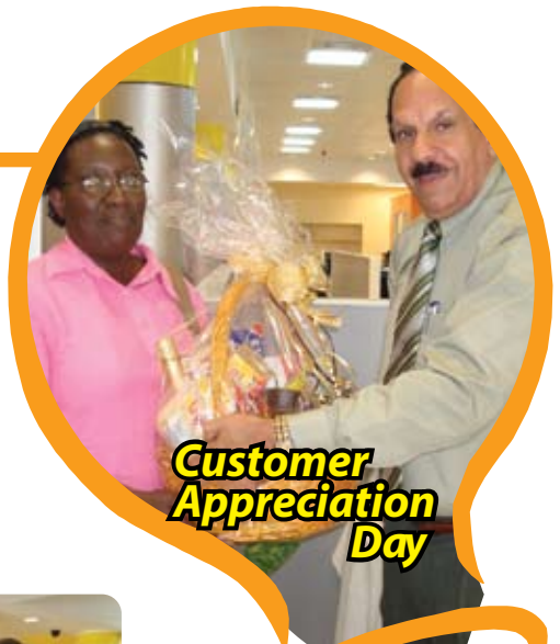
Customer Appreciation Day

T&TEC commemorated its 2008 Annual Customer Appreciation Day on July 25th. Fourteen Service Centers across the nation participated in activities aimed at thanking to our customers.