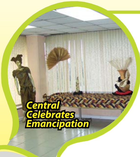
Central Celebrates Emancipation