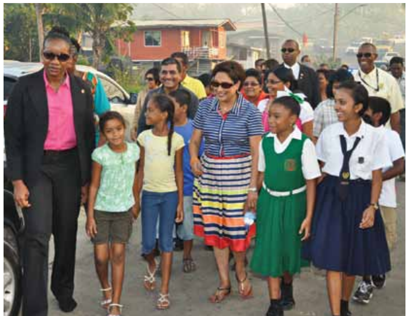
The Prime Minister arrives surrounded by children at the ceremony at Boucaud Trace Recreation Ground.

In February, the development initiative put some focus on youths, with the illumination of the Naparima College Recreation Ground and the Bhupsingh Play Park in Penal, which was supported by the Member of Parliament, the Honourable Kamla Persad-Bissessar. Naparima College, a school with a 199-year history, was the first school ground in South to be lit under the programme. The