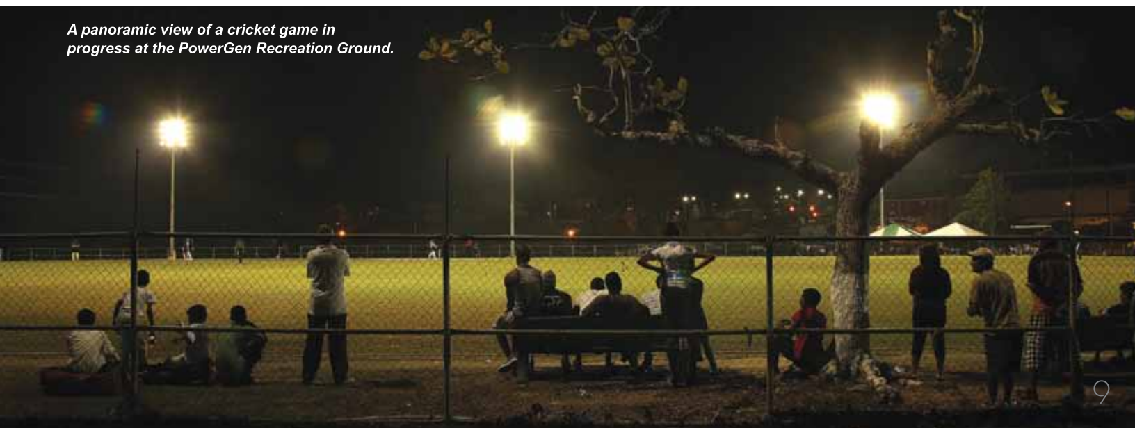
A panoramic view of a cricket game in progress at the PowerGen Recreation Ground.