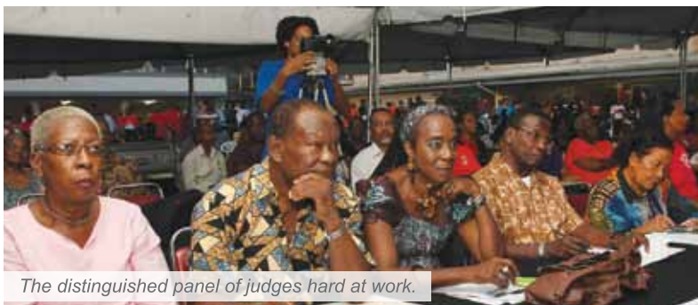
The distinguished panel of judges hard at work.