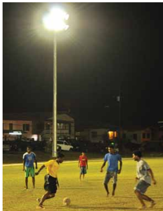
Villagers play football under the newly-lit lights at Sunrees Recreation Ground.