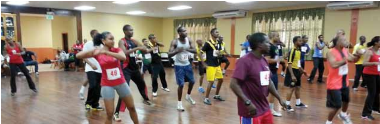
Some of the competitors in action

Scores of participants, representing several Area Sports Clubs, arrived at the Northern Area Sports Club pumped up with energy and anxious for the start of the T&TEC General Sports and Cultural Club's (GSCC) annual Inter-Area Aerobics Burnout.