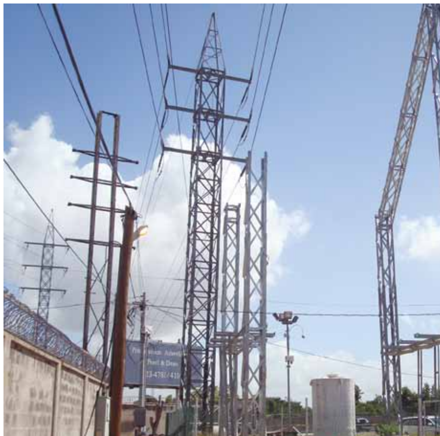
The transition structure at Caricom Jetty off Wrightson Road, which facilitates the transition from overhead lines to underground cables.