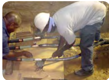
Distribution North Crews 186 and 187