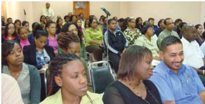
Some of the Head Office employees in attendance.

It is anticipated that this latest round of HSE refresher sessions would help to inculcate a safety culture at T&TEC where safety becomes a way of life for employees.