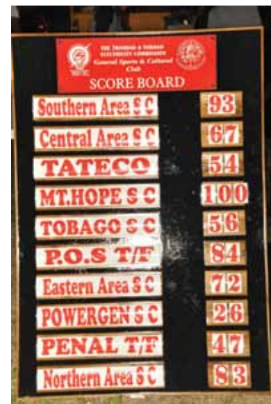
The scoreboard showing the final tally.