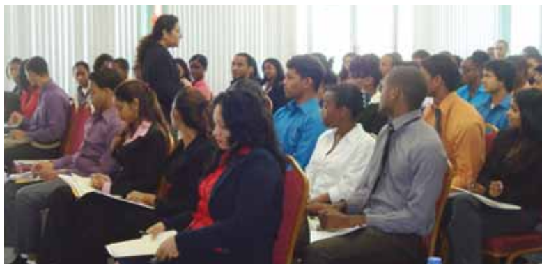
A cross section of the vacation employees during their orientation session.

Ninety university students were formally inducted as vacation employees at T&TEC on June 10 2013. The two-month programme will allow the students to earn while they learn.