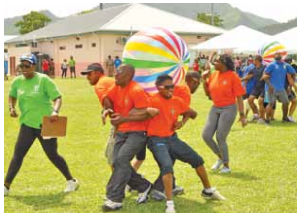
Putting team unity to the test in 'balance de ball'.