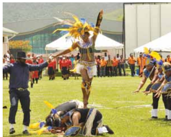
Eastern Area employees during their African-themed presentation.