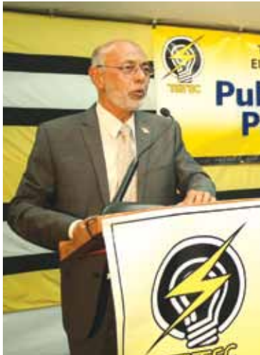
Minister Nizam Baksh addresses residents at Hillpiece Village.

The Minister of Public Utilities, the Honourable Nizam Baksh, has lauded T&TEC's efforts in national development through its Public Lighting Programme, which continued between the months of April and June.