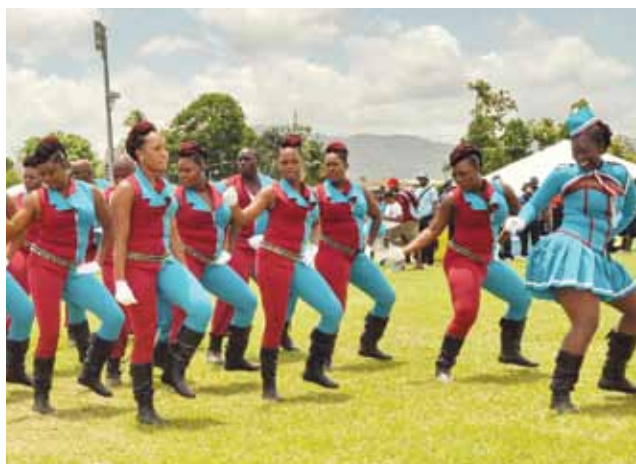
Sassy moves from team Mt. Hope.