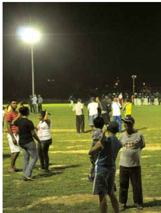
Residents gather at the Caparo Recreation Ground under their newly-installed lights.